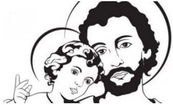
St. Joseph, Pray for Us

Weekday Masses: Monday - Saturday: 9:00am