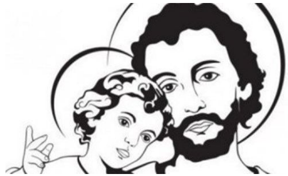
St. Joseph, Pray for Us

Weekday Masses: Monday - Saturday: 9:00am