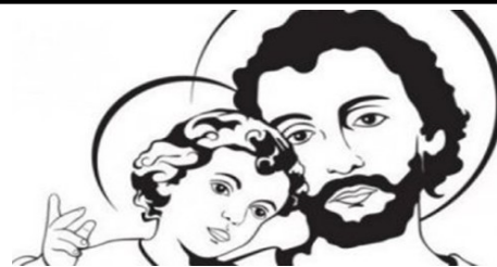
St. Joseph, Pray for Us