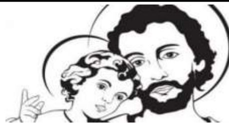
St. Joseph, Pray for Us